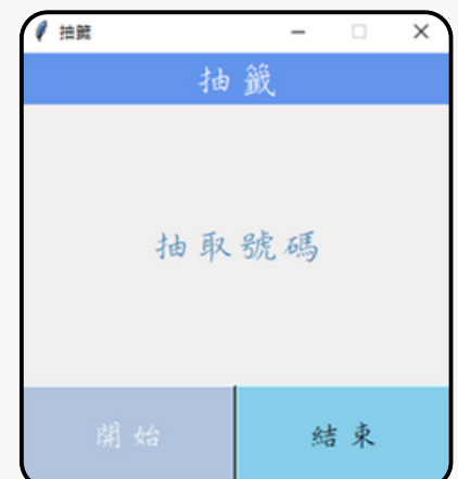
DRAW LOTS ▶